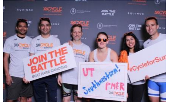
Faculty & residents at Cycle for Survival