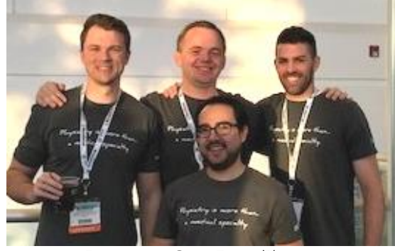
Residency Quiz Bowl Team

I will end with endless gratitude for old and new faculty as this residency would not be possible without them. Several changes are in thanks to wonderfully energetic new faculty the past couple of years, and we as a department look forward to more good changes to come!