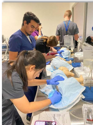
Residents practice advanced skills such as albuterol administration and lumbar punctures in the fully equipped UTSW Simulation Center.

Integration of a novel medical humanities curriculum has been used to promote reflection, empathy, and meaning in medicine during residency training. Residents are exposed to creative works such as film shorts, translated novels with coming-of-age themes, documentaries, and visual works of art and are asked to reflect using techniques borrowed from narrative medicine. In the adolescent rotation, discussions cover a range of topics, from the juvenile justice system and child violence to eating disorders and body image, providing for deeper insight into the nuanced care of teenagers. Medical humanities work has so far been incorporated into Grand Rounds, Academic Halfday, and the Adolescent & Young Adult rotation.