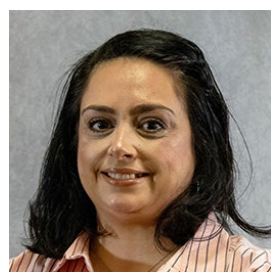
<u>Program Coordinator – Advanced Fellows</u>