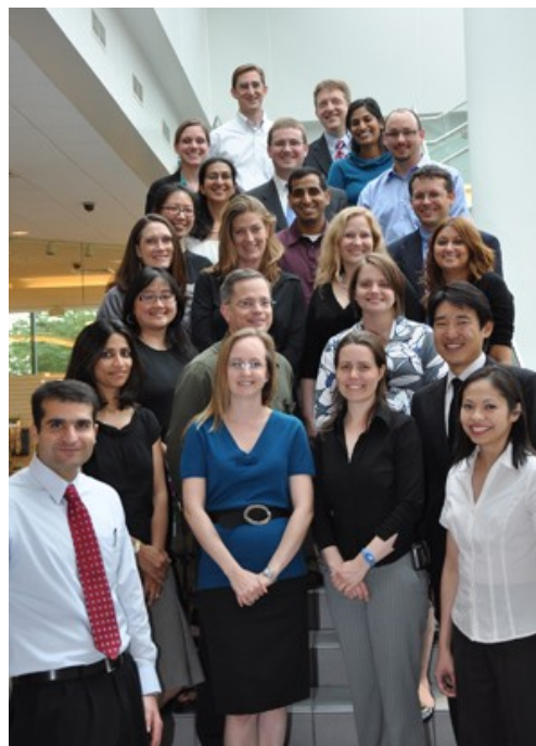
2010 Fellow Graduates