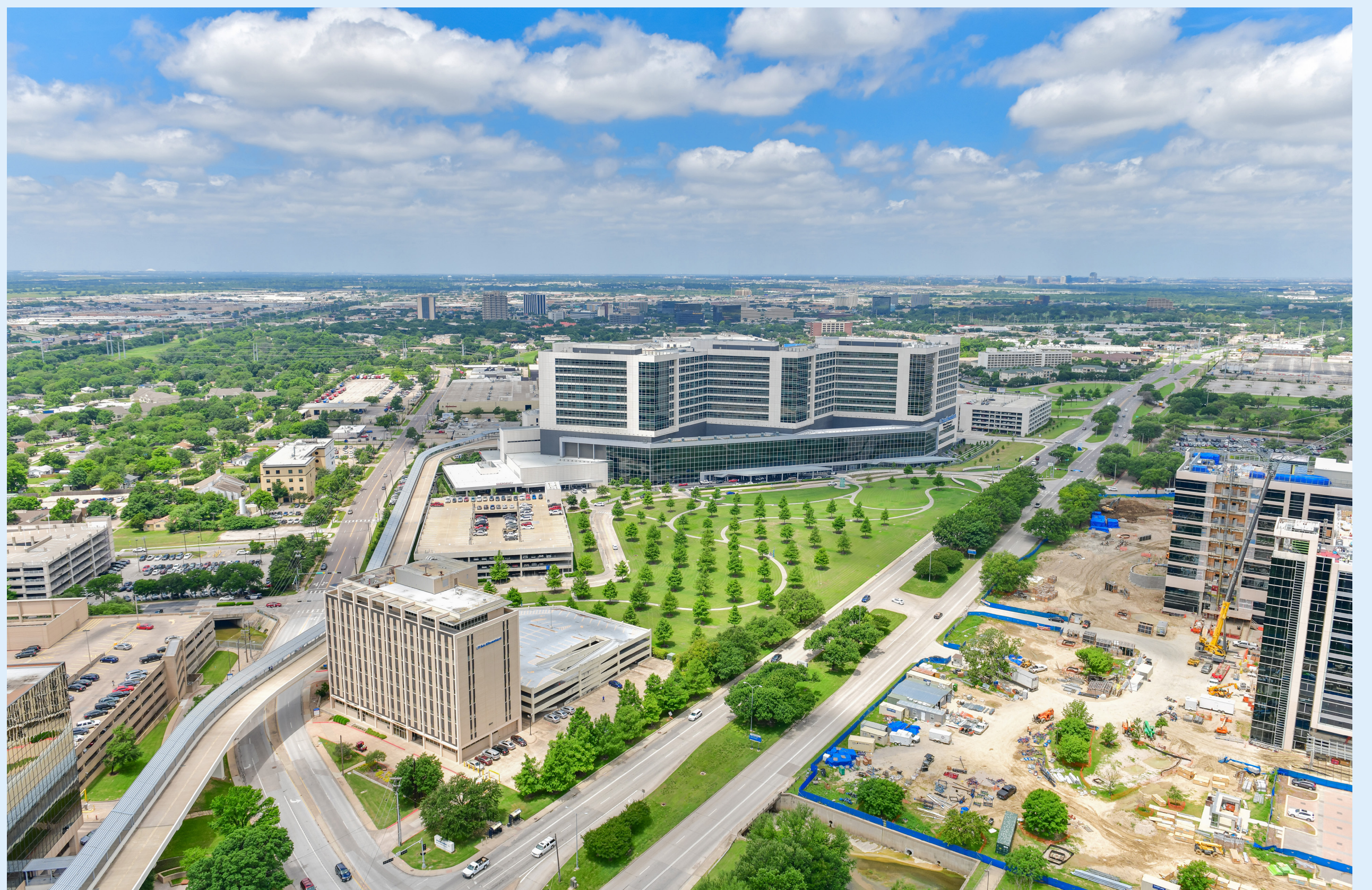
UT Southwestern Medical Center 2021