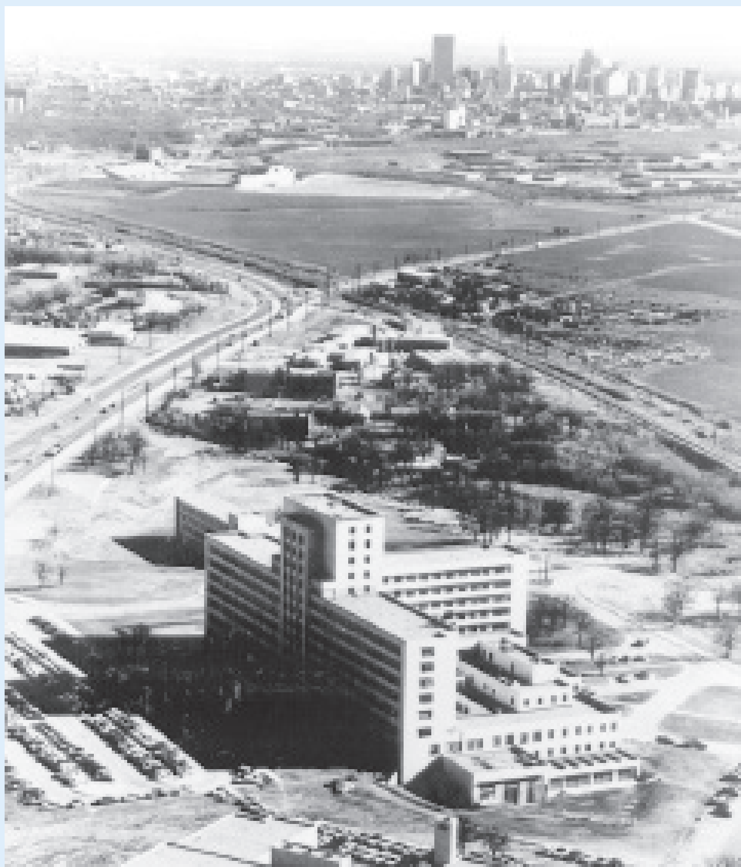
Southwestern Medical School 1958

Solidly committed to basic scientific research; teaching future ophthalmologists; and medical and surgical treatment of eye problems, the Department of Ophthalmology at UT Southwestern Medical Center is prepared to bring the latest ophthalmic findings from the laboratory to the bedside.